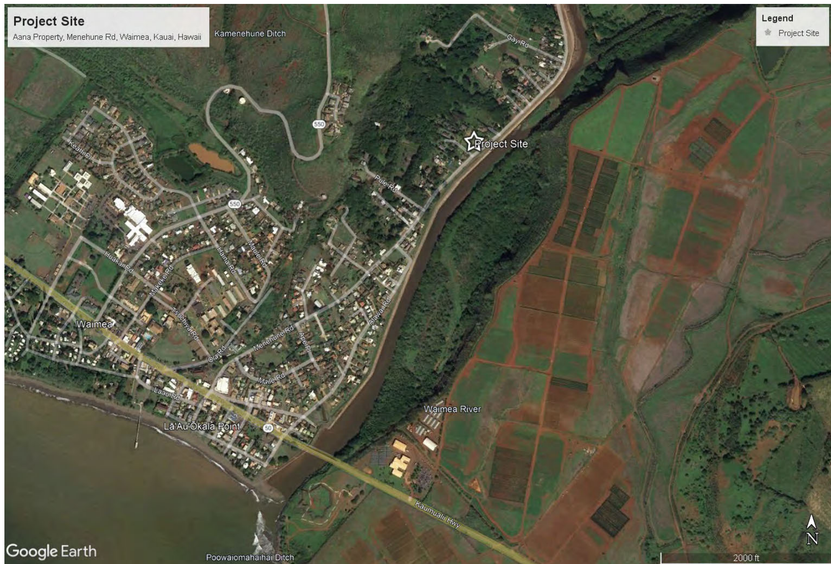
Figure 2. Aana Property Project Site Map. Menehune Rd, Waimea, Kauai, Hawaii. TMK (4) 1-6-002-009 whose Latitude and Longitude are 21.963175°N and 159.659026°W.