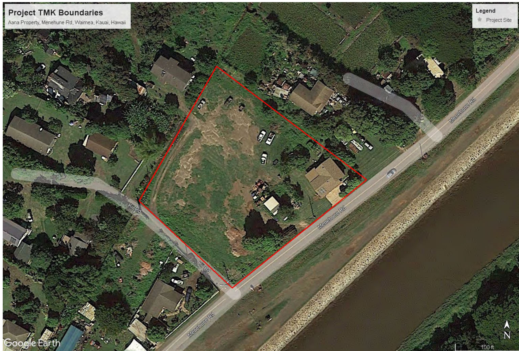
Figure 3. Aana Property Tax Map Key Boundaries. Menehune Rd, Waiamea, Kauai, Hawaii. TMK (4) 1-6-002-009 whose Latitude and Longitude are 21.963175°N and 159.659026°W.