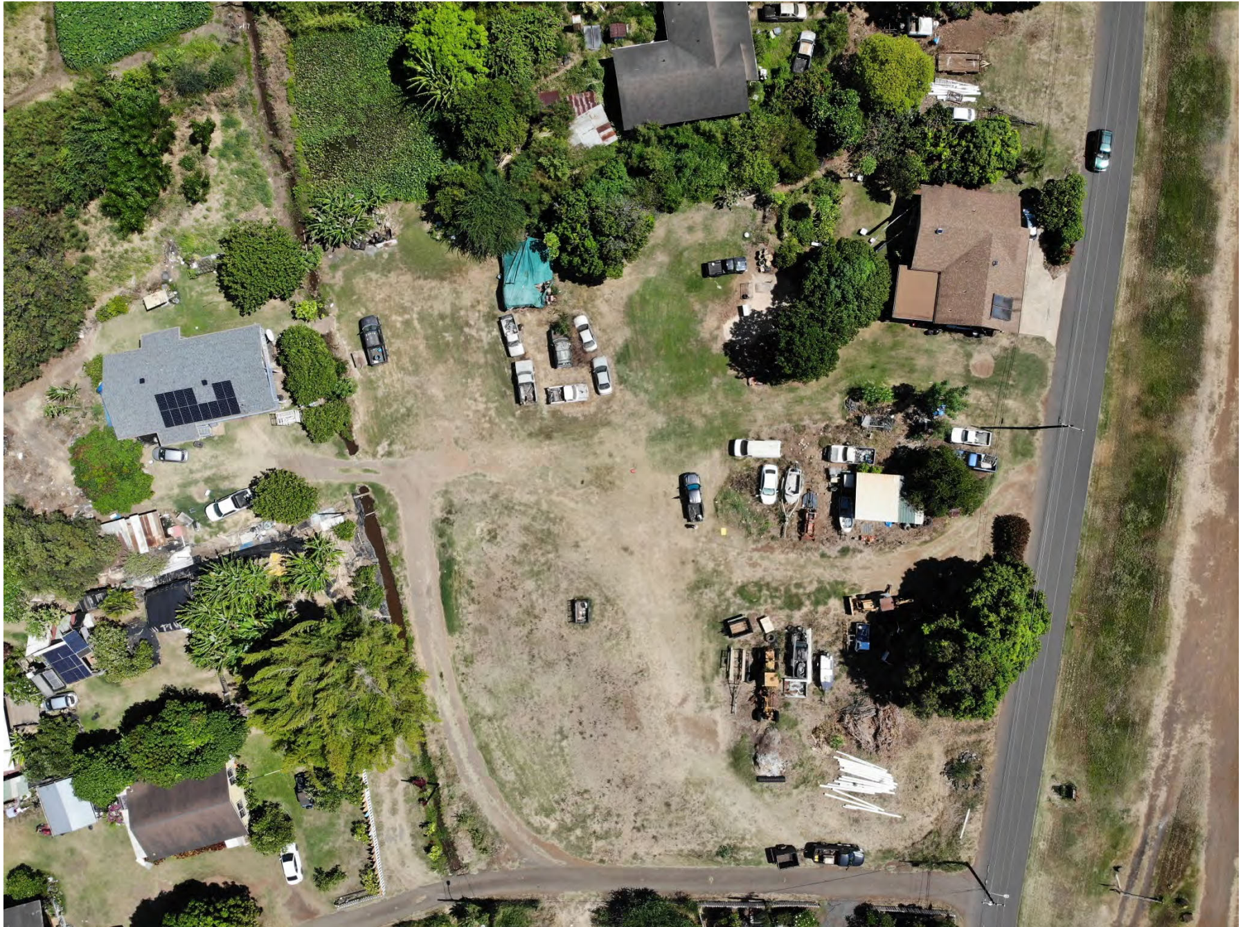
Figure 4. September 23, 2023 aerial image of the Project Site. Menehune Road and the levee are to the right, Kii road along the bottom. Peekauai ditch is left of center.