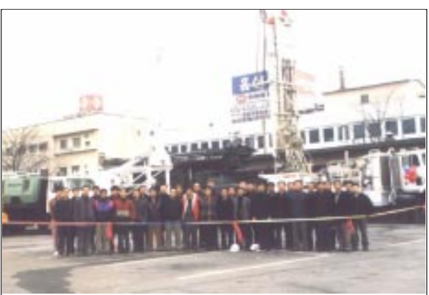
Anxiously waiting to have their picture taken, FED's foundation and well drilling teams are ready to put the new equipment into action.

Completion of the Drill Rig Shelter currently under construction at FED is scheduled for Spring, 1999.