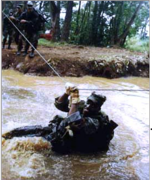
Neither rain nor mud nor the lack of a bridge will stop a soldier. The Army's purchase of the Kahuku Training Area site ensures its continued availability for training on the island of Oahu.

Purchasing may be cheaper, but not necessarily easier. There were some factors that complicated the transaction, said Stomber. One was that the property includes lands that are currently in use for electricity-generating windmills and other functions. In all, 107 easements were negotiated that affected nearly 400 acres. Another, is that the entire