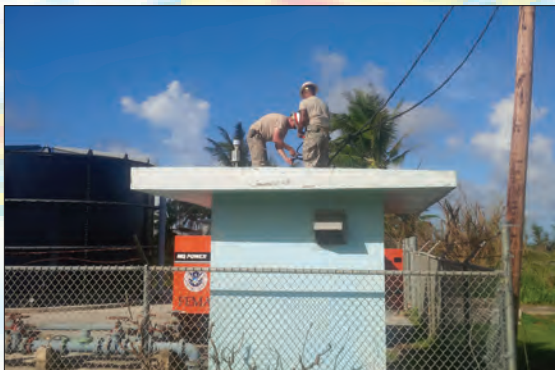
Soldiers from the U.S. Army's 249th Engineer Battalion (Prime Power) Delta Company, connect emergency generator power lines to a water pump substation on Saipan as part of the federal response to Typhoon Soudelor.