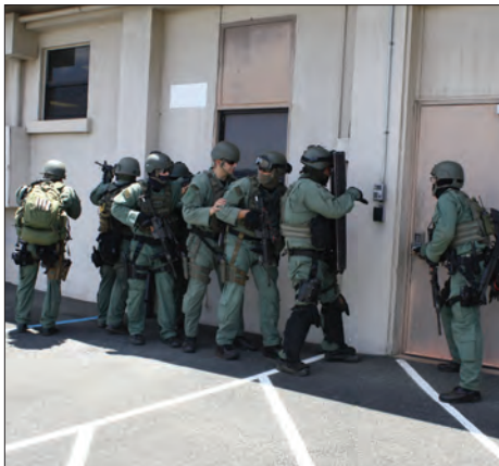
Members of the 39th MP Det. SRT prepare to face the unknown as they enter the Honolulu District's Regulatory office during the active shooter training exercise.