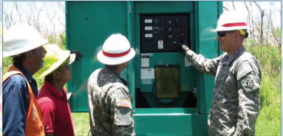
In support of the governor, local responders, the Federal Emergency Management Agency (FEMA), and a USACE Power Planning and Response Team (Power PRT) from the Honolulu District made a huge difference. This specialized team worked with the U.S. Army's 249th Engineer Battalion, contractors, and commonwealth and local entities to assess, install and maintain emergency generators at critical facilities, especially at wells to ensure that residents of Saipan get a much-needed supply of drinking water.