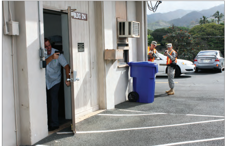
First responders from 558th Military Police (MP) Company, 728th MP Battalion, 8th MP Brigade, 8th Theater Sustainment Command, arrive on scene and secure the area during an active shooter training exercise held at Honolulu District's Regulatory Office.

A call was made and first responders arrived on scene, secured the location and became the eyes and ears for other emergency responders. In order for emergency responders to collaborate with each other, a temporary base of opera-