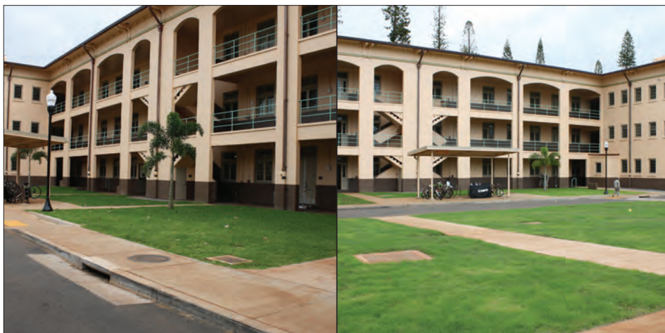
The rehabilitation of Buildings 450 (left) and 451 (right) of Quad D are part of U.S. Army Garrison Hawaii's Whole Barracks Renewal Program, which aims to restore the five historic barracks on post, including one (Quad B) that was built in 1914.