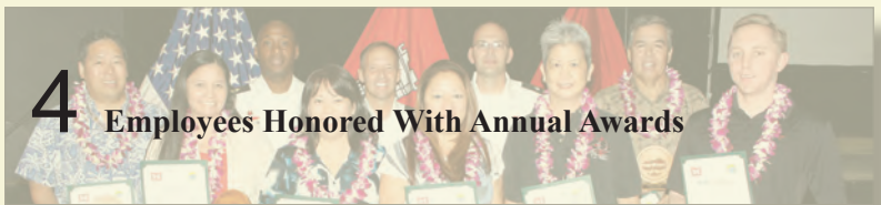
4 Employees Honored With Annual Awards