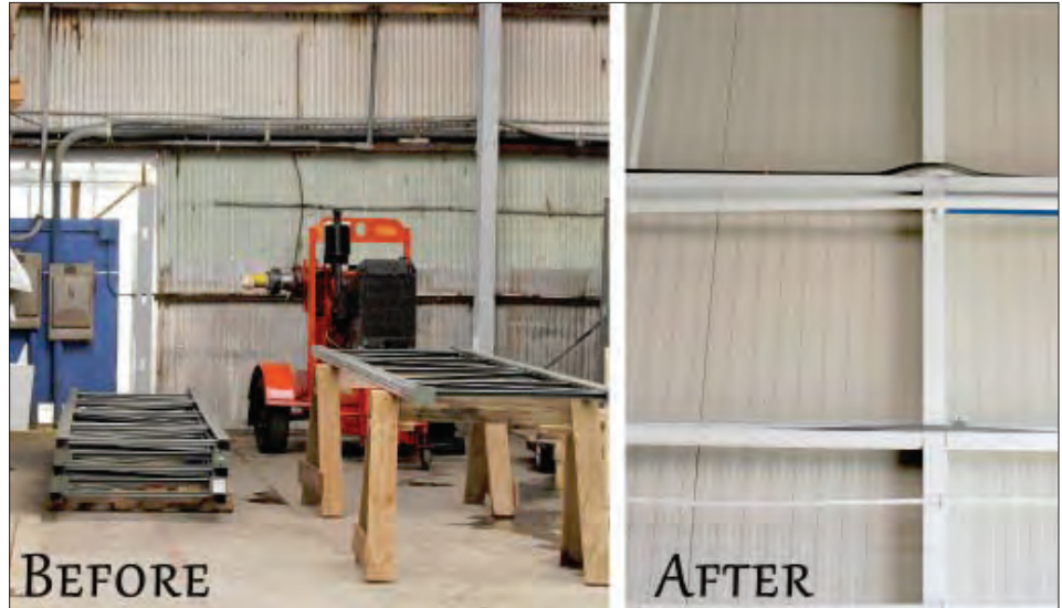
Improvements to the Water Treatment Plant include additional structural steel where needed, new insulated aluminum panels and a protective coating on the interior and exterior.

The KRO is a contract administration group. Their mission on Kwajalein is to administer construction contracts which are awarded out of the Honolulu District. Three construction companies bid projects as part of a Multiple Award