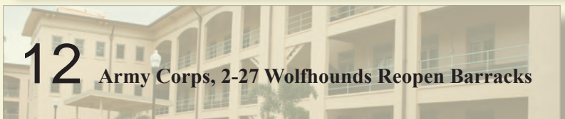
12 Army Corps, 2-27 Wolfhounds Reopen Barracks