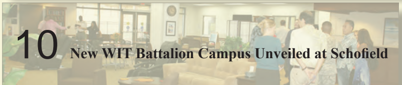
10 New WIT Battalion Campus Unveiled at Schofield