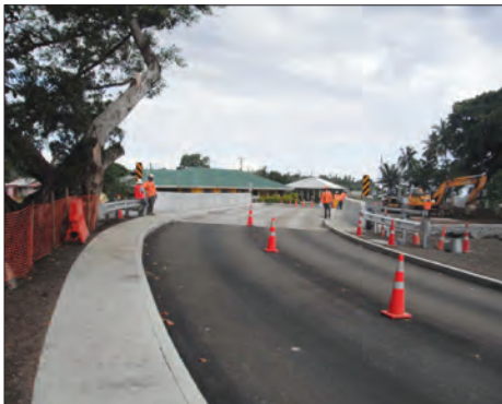
In mid-September the American Samoa government held a dedication and ribbon-cutting ceremony for the Corps-built $5.4 million Leone Bridge on Tutuila Island. The original Leone Bridge was damaged beyond repair during the 2009 tsunami.

In February, several of the District's Department of the Army (DA) interns showcased District capabilities by creating Corps of Engineers and Honolulu District photographic exhibits highlighting District's missions for public dis-