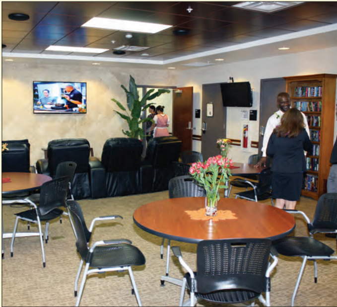
A view inside the Soldier & Family Assistance Center lobby after the ribbon-cutting ceremony for Schofield's new WTB campus. See the story and more photos on page 10.