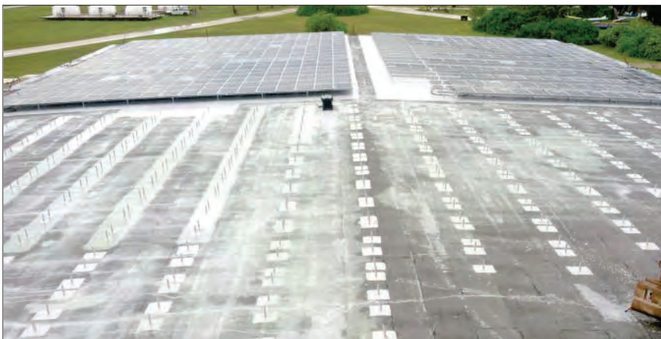
The Solar Photovoltaic System project on the roof of building 993 is 50 percent finished. The project is being overseen by the U.S. Army Corps of Engineers. Construction is being done by Nan, Inc.

Projects are chosen by USAG-KA command based on the greatest need and funding availability. Funding comes from the base operations budget or supplemental government programs. Brian Ebel, energy manager at DPW, submitted a write-up explaining the cost savings for the solar panel and lighting retrofit projects. The Energy Conservation Investment Program provided the funding for those particular projects. Future projects include work on a fuel tank on Roi, an overhaul of the warehouse facility 602 on Kwajalein and installing mist eliminators at the Kwajalein Power Plant.