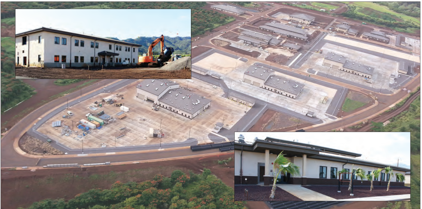
(Top) An aerial view of the 88-acre South Range construction area shows facilities that will enable the Army more ease in training and maintaining unit readiness, which equates to more productivity, higher morale, and better support to USARPAC and the rebalance to the Asia-Pacific region. (Inset) Images shows South Range facilities nearing completion in 2014.

struction, the Army acquired the property from previously used pineapple farm land and designed and constructed complete utilities and infrastructure. As with all projects the District builds, protecting the aina (the land) is an on-going priority. This program also supports PACOM's Asia-Pacific rebalance.