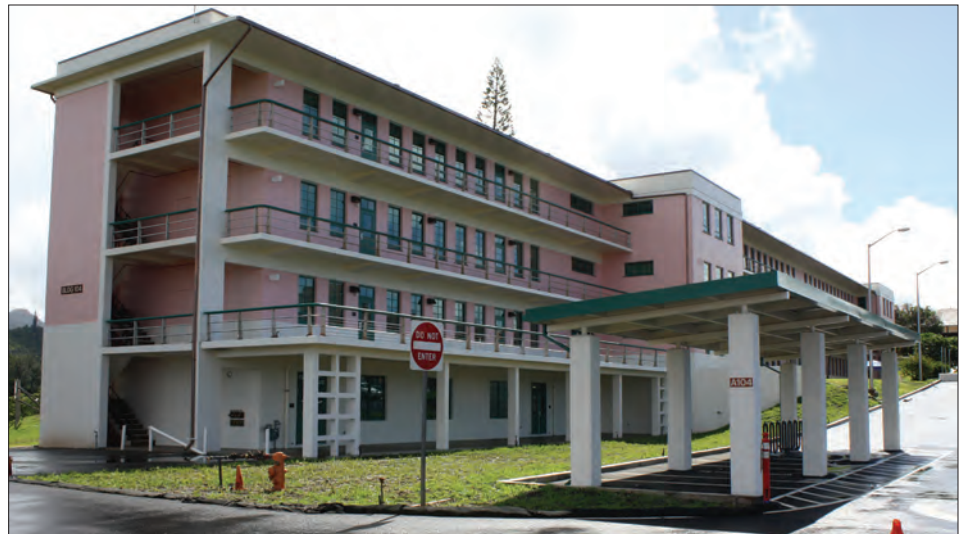
Honolulu District, U.S. Army Garrison-Hawaii, Tripler Army Medical Center and contractor Sumo-Nan, Inc. officials opened a renovated Unaccompanied Enlisted Personnel Housing (UEPH/ Building 104) in late May 2014. Building 104 was one of the original structures built and completed by the Corps in 1948. It has been renovated on several occasions and today the exterior - including the coral pink color - looks much the same as it did after its original construction.

play at Pearlridge Shopping Center as part of the 2014 Engineers Week.