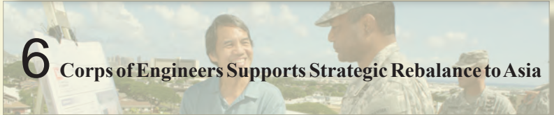
6 Corps of Engineers Supports Strategic Rebalance to Asia