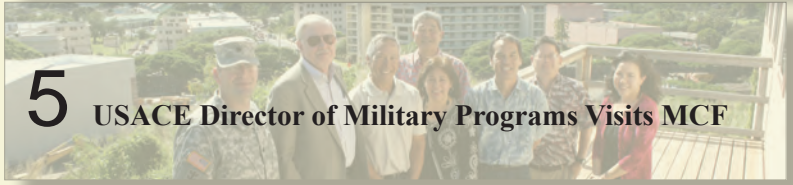
5 USACE Director of Military Programs Visits MCF