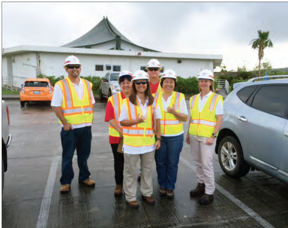
Honolulu District Power Planning and Response teammates (Power PRT) take a break from their work in response to Typhoon Soudelor on Saipan in August 2015. This specialized team worked with the U.S. Army's 249th Engineer Battalion (Prime Power), contractors, and commonwealth and local entities to assess, install and maintain emergency generators at critical facilities, especially at wells to ensure that residents of Saipan get a much-needed supply of drinking water.

Honolulu District fields two Emergency Power and Planning Response Teams (Power PRT) and a Containerized Tactical Operations Center (CTOC) team who provide state and local officials with a variety of support regarding