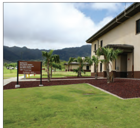
The 29th Engineer Battalion Headquarters was one of the new facilities built by the Corps of Engineers on the South Range Road Project cantonment.

The Honolulu District is committed to building and managing the construction of high quality projects that improve the quality of life for service members and their families and that provide jobs and money which stimulate the local economy.