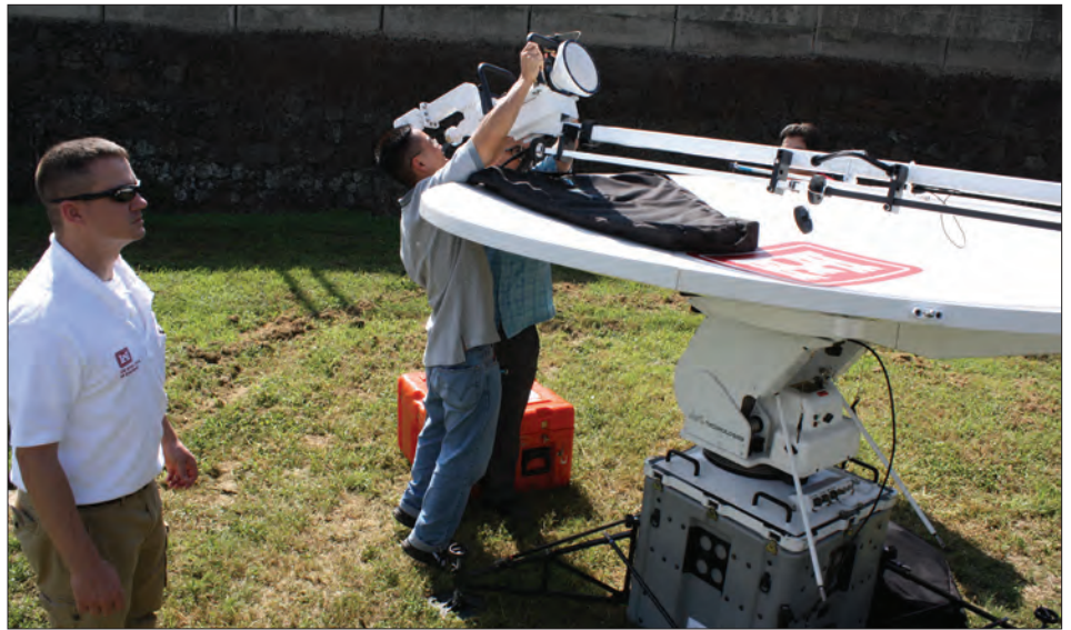
Honolulu District’s Containerized Tactical Operations Center (CTOC) team sets up a satellite dish during a training evolution in January.

“We’re (the Power PRTs) typically the first people out there and also typically the first success story. Our big achievement is generally during the first four days after a storm’s landfall – when bad news after bad news story is the norm and everyone is still in a recovery mode. That’s a very gratifying feeling.”