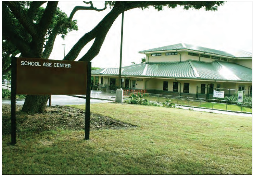
The District and U.S. Army Garrison-Hawaii celebrated the grand opening of the Corps-built Fort Shafter School Age Center in early December.

District contract actions signify the Corps' commitment to provide high-quality facilities to the Armed Forces and to protect and improve the lives of the people of Hawaii and the region. Honolulu District is responsible for major military design and construction, civil works, international and interagency support, real estate services to the Army and Air Force, regulatory work, environmental services and emergency management.