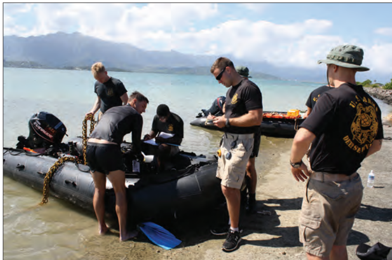
Soldiers from the U.S. Army's 7th Dive Detachment ready their dive gear and rib boat before heading out into the waters of Kaneohe Bay to conduct a dive survey for the U.S. Army Corps of Engineers, Honolulu District in support of a Navy Dept.-financed structural study of the historic Seaplane Ramps at Marine Corps Base Hawaii (MCBH) on Kaneohe Bay.

The Honolulu District is committed to supporting our federal partners and stakeholders by executing high quality studies and projects, and the District was honored to support the mission to document and analyze such an historic military site.