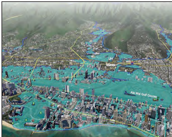
A rendering of the Ala Wai Watershed shows the potential extent of inundation resulting from the 1 percent annual chance exceedance flood.