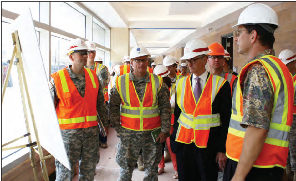
Former Secretary of the Army John McHugh and senior USARPAC and Corps leaders were briefed on the construction status of the USARPAC Mission Command Facility (MCF) at Fort Shafter in April 2015.

The District's Regulatory Office made significant efforts in improving coordination/collaboration with interagency and interservice partners throughout the Pacific and creating a more efficient 401 Permitting process with the State of Hawaii.