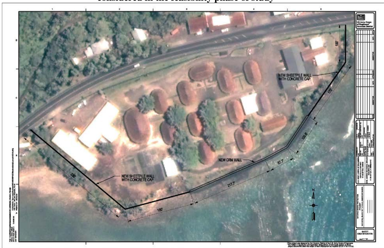
Figure 2: Aerial Image of Project Location showing one of the alternatives to be considered in the feasibility phase of study

c. Factors Affecting the Scope and Level of Review. As a CAP project, the project risks are minimal. Environmental impacts are anticipated to be less than significant. Plan formulation is not expected to be challenging or novel. The project is not anticipated to require redundancy, resiliency and/or robustness, unique construction sequencing, or reduction in overlapping design construction schedules. There has been no request by the Governor for peer review by