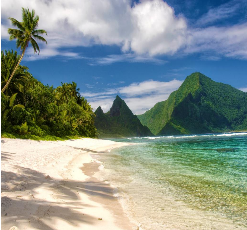
Ofu and Olosega

The Territory of American Samoa Post-Disaster Watershed Assessment