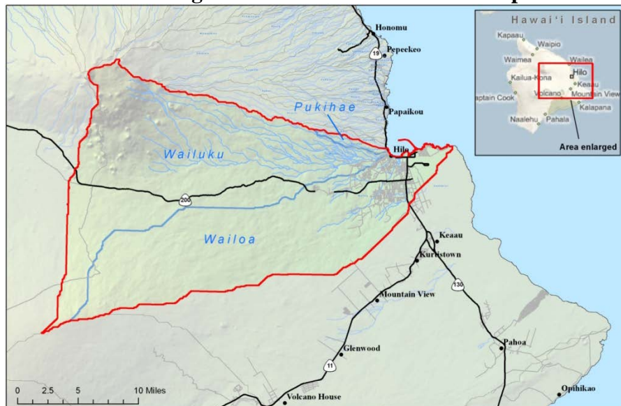
Figure 1: Hilo Harbor Location Map

d. Study Location. The Hilo Deep Draft Harbor is located on the northeast coast of the Island of Hawaii (see Figure 1).