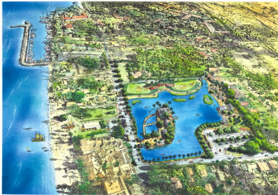
Artistic Rendering Courtesy of Friends of Moku'ula

U.S. Army Corps of Engineers, Honolulu District