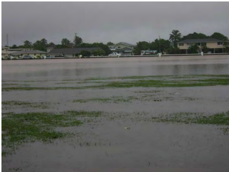
Lā‘ie Flooding in 2012

U.S. Army Corps of Engineers, Honolulu District