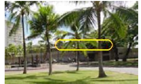
Battery Randolph Second Floor