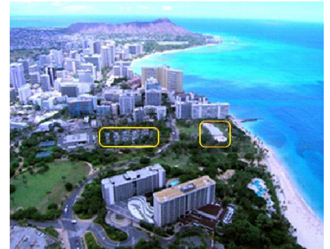
Left: Saratoga/Kalia Parking lot Right: Battery Randolph