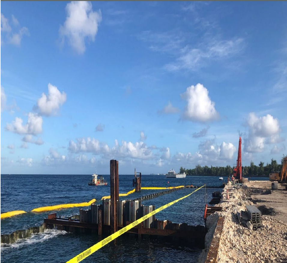
Echo Pier, Kwajalein