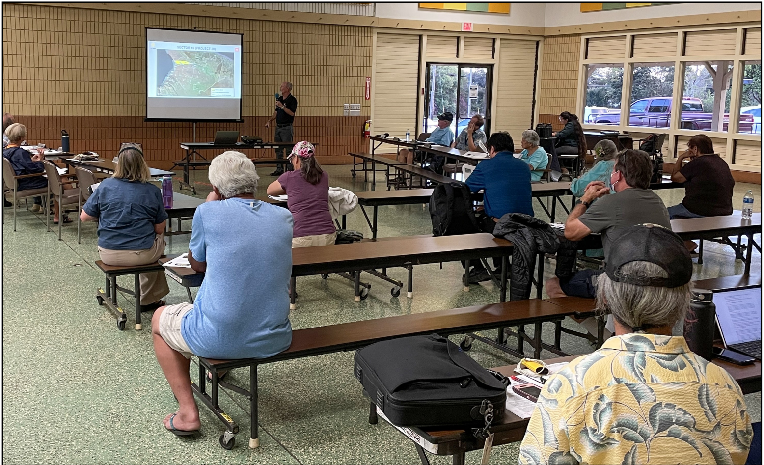
Members of the Waikoloa Maneuver Area Restoration Advisory Board participate in the fall 2023 meeting, which was conducted Oct. 24 in Waimea on the Island of Hawaii.

The WMA Restoration Advisory Board consists of individuals from the community who are affected by the environmental restoration activities because they live and/or work near the