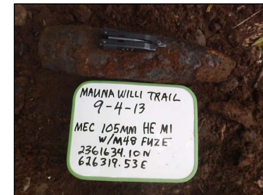
Figure 2 - 105-mm Projectile

Project Property History. The PTC was opened in 1943 on property then belonging to Harold K.L. Castle. It was used from 1943 to 1945 as a regimental combat team training center emphasizing the use of and familiarity with modern arms and field weapons in a rugged terrain and jungle environment. In addition, the PTC provided rugged terrain for jungle and Ranger training. An artillery impact area was also established in the rear of Maunawili Valley. In 1945, the U.S. Army released PTC and the encampment was abandoned by the end of 1945. All on-site buildings were sold for scrap in 1946 and the land reverted back to the previous owner. Currently, the ownership of the former PTC is split between the State of Hawaii and various private landowners.