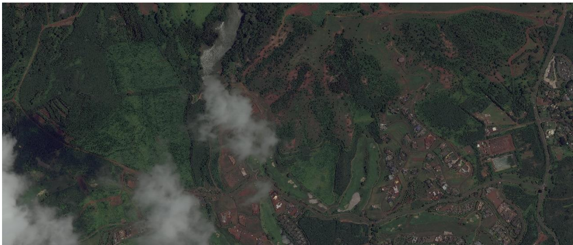
Figure 5. Satellite imagery showing the Manuhonuhonu Reservoir in June 2024.

11. NOTE: The structure and format of this MFR were developed in coordination with the EPA and Department of the Army. The MFR's structure and format may be subject to future modification or may be rescinded as needed to implement additional guidance from the agencies; however, the approved jurisdictional determination described herein is a final agency action.