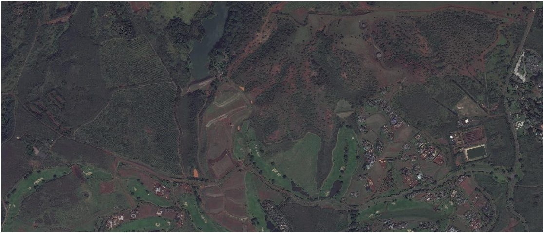
Figure 4. Satellite imagery showing the Manuhonuhonu Reservoir in December 2022.

SUBJECT: 2023 Rule, as amended, Approved Jurisdictional Determination in Light of Sackett v. EPA , 143 S. Ct. 1322 (2023), POH-2022-00127