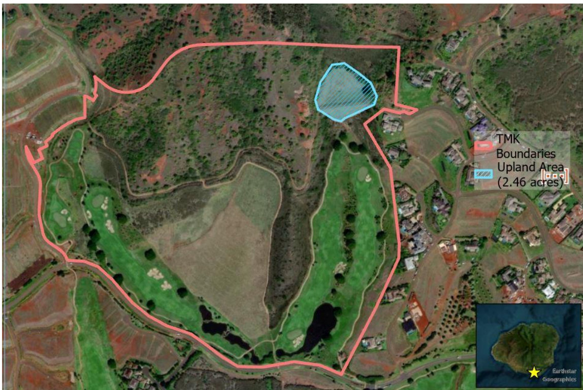
Figure 1. Map showing the review in Koloa, Island of Kauai, Hawaii.

SUBJECT: 2023 Rule, as amended, Approved Jurisdictional Determination in Light of Sackett v. EPA , 143 S. Ct. 1322 (2023), POH-2022-00127