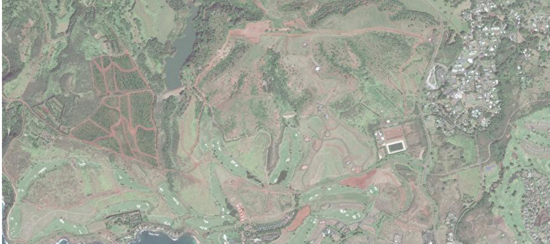
Figure 2. Satellite imagery showing the Manuhonuhonu Reservoir in December of 2014.