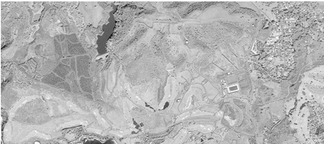
Figure 3. Satellite imagery showing the Manuhonuhonu Reservoir in February of 2015.