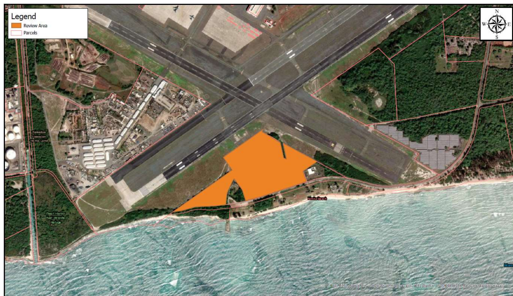
Figure 1: Map of review area, highlighted in orange.

SUBJECT: 2023 Rule, as amended, Approved Jurisdictional Determination in Light of Sackett v. EPA , 143 S. Ct. 1322 (2023), POH-2024-00024