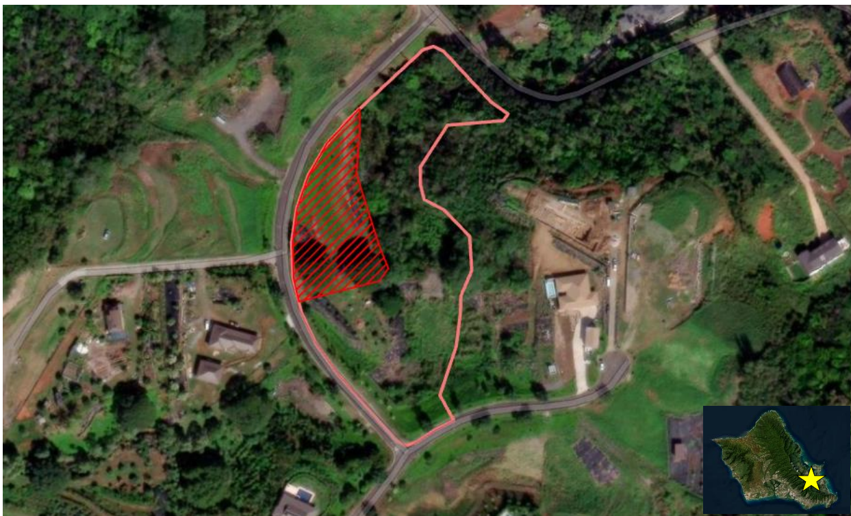
Figure 1. Map depicting the review area for the jurisdictional determination.

SUBJECT: 2023 Rule, as amended, Approved Jurisdictional Determination in Light of Sackett v. EPA , 143 S. Ct. 1322 (2023), POH-2024-00112