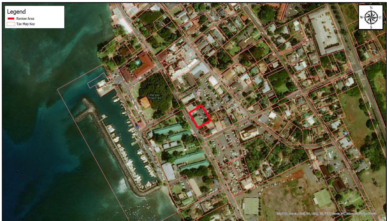
Figure 1: Map of Review Area

SUBJECT: 2023 Rule, as amended, Approved Jurisdictional Determination in Light of Sackett v. EPA , 143 S. Ct. 1322 (2023), POH-2024-00169