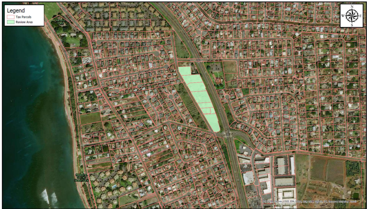
Figure 1: Review area with tax parcels overlay

SUBJECT: 2023 Rule, as amended, Approved Jurisdictional Determination in Light of Sackett v. EPA , 143 S. Ct. 1322 (2023), POH-2024-00063