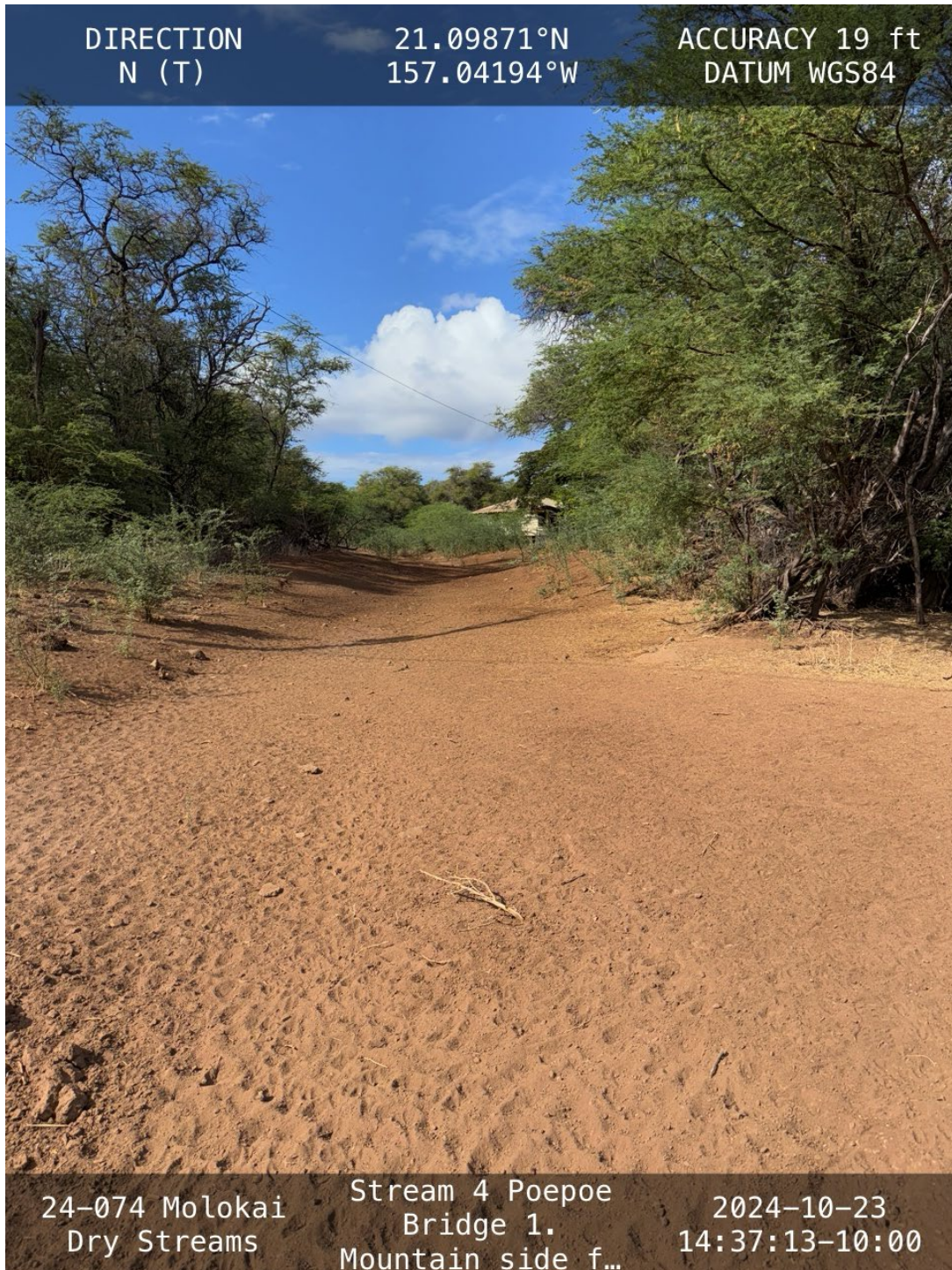
Figure 1-Poepoe Stream from Mauna Loa Hwy bridge looking upstream