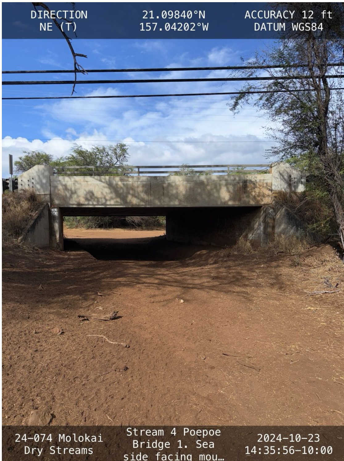
Figure 2-Mauna Loa Hwy bridge from ocean side looking upstream

SUBJECT: 2023 Rule, as amended, Approved Jurisdictional Determination in Light of Sackett v. EPA , 143 S. Ct. 1322 (2023), POH-2025-00233