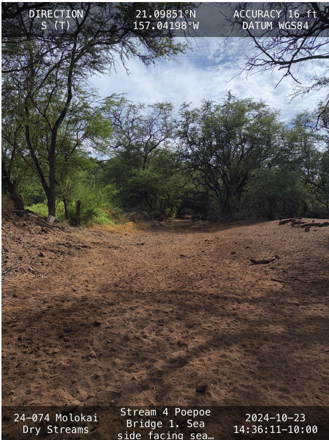
Figure 3-From Mauna Loa Hwy bridge looking downstream at end of review area

SUBJECT: 2023 Rule, as amended, Approved Jurisdictional Determination in Light of Sackett v. EPA , 143 S. Ct. 1322 (2023), POH-2025-00233