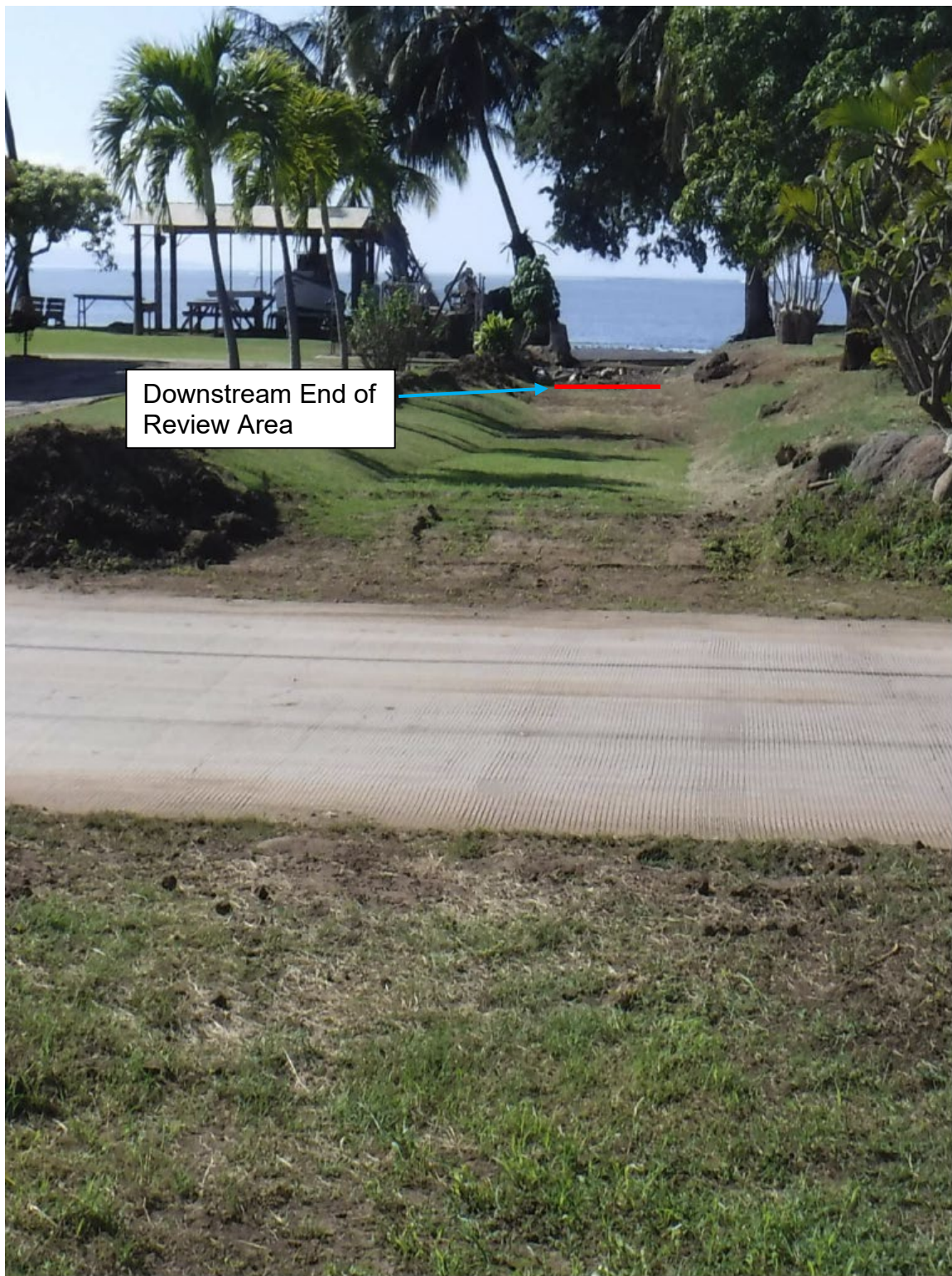
Figure 3- Kapa'akea Stream East looking downstream from Kapaakea Loop

SUBJECT: 2023 Rule, as amended, Approved Jurisdictional Determination in Light of Sackett v. EPA , 143 S. Ct. 1322 (2023), POH-2025-00236