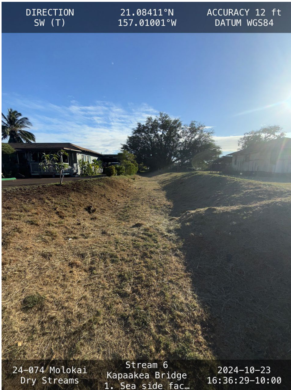
Figure 2- Kapa'akea Stream East looking downstream from Mauna Loa Hwy

SUBJECT: 2023 Rule, as amended, Approved Jurisdictional Determination in Light of Sackett v. EPA , 143 S. Ct. 1322 (2023), POH-2025-00236