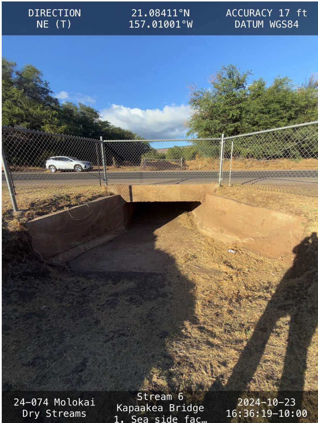
Figure 1- Kapa'akea Stream East looking upstream at Mauna Loa Hwy culvert