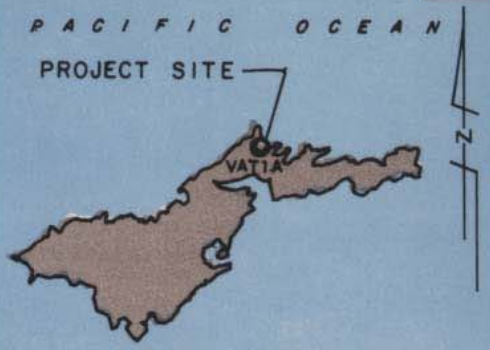
LOCATION MAP ISLAND OF TUTUILA SCALE IN MILES