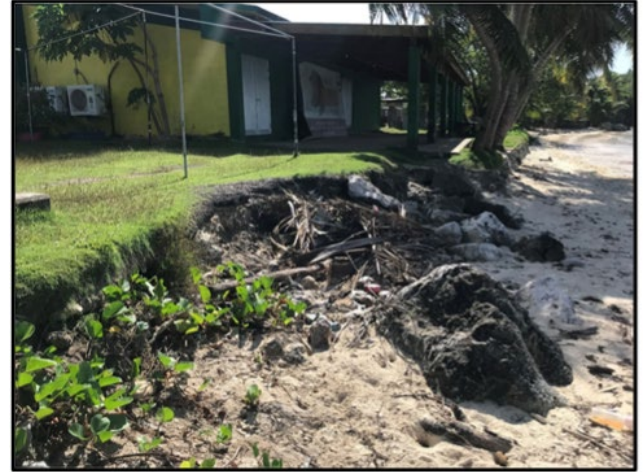
Figures 2 and 3: Erosion and undermining of the existing seawall built to protect the facilities is visible in within the study area.

The U.S. Army Corps of Engineers is responsible for delivering vital engineering solutions, in collaboration with our partners, to secure the nation, energize our economy, and reduce disaster risk. As the nation's lead engineering and public works agency, we deliver quality projects, on time and within budget, - safely - for the American people.