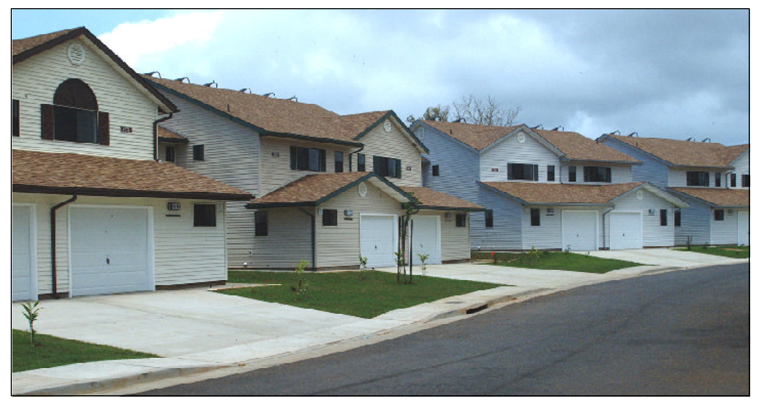
New family housing has been completed at Schofield Barracks for junior non-commissioned offiers and company grade officers. The project also includes outside beautification.