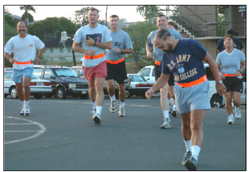
Nearly 70 Honolulu District employees donned work-out gear and gathered at 6:30 a.m. May 14 for the District's annual Safety Day run/walk. Above, the District's runners move out ahead of the pack.