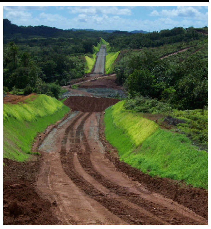
Construction is progressing on the 53-mile long Palau Compact Road.

Training was conducted six evenings a week for approximately three hours per session. The training week was divided into four days paddling and two days of fitness training. Three paddle-days, usually Monday, Wednesday and Friday were composed of different length sprints and turns. Normally we would paddle 10 to 12 kilometers per training session. Saturday