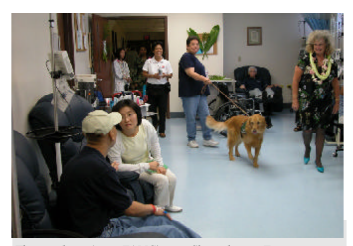
The grand opening at TAMC's new Chemotherapy Treatment Center took place Sept. 9. Improvements include individual televisions, increased seating for family members, overstuffed chairs for comfort and curtains for privacy. Contractors and staff from HED were instrumental in the improvements and additions to the new room and pharmacy.