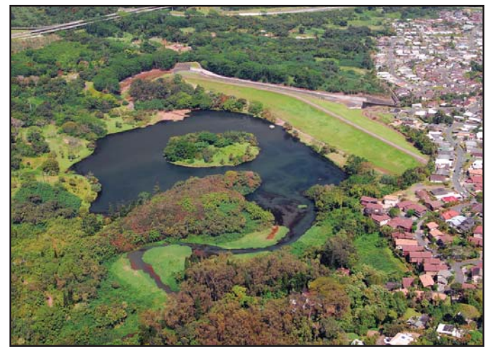
An aerial view shows the Kaneohe-Kailua Dam Flood Control Project berm, which was one of the District civil works projects Maj. Gen. "Bo" Temple visited during his recent visit to Oahu.