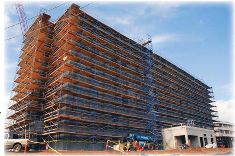
fort between the Corps The new Fort Shafter barracks takes shape on Favreau Field, July 2009.

Again, gang, although you are my 'ohana' these unselfish hearts