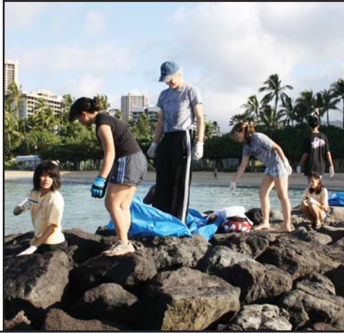
NPLD Continued on page 9

"National Public Lands Day is an opportunity for all Americans, young and old, to celebrate the majesty of our open spaces and devote our collective efforts to conserving our Nation's unique landscapes. Committed indi-