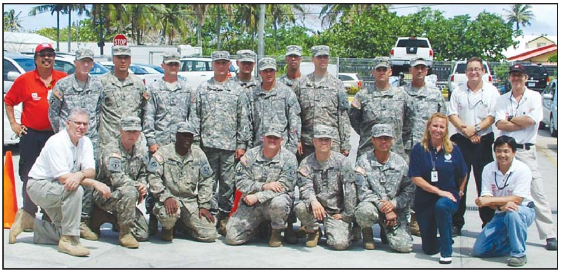
Emergency responders from Honolulu District, U.S. Army 249th Prime Power Engineer Battalion and FEMA pose outside their base headquarters in American Samoa.

FEMA is the lead agency for coordinating government response to natural disasters.