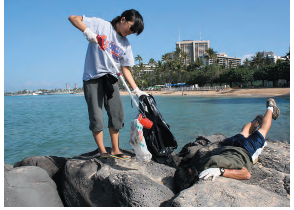
Students from the Punahou High School Junior ROTC program and Corps' employees and family members joined forces to clean up the beach and berm area of the Corps' Pacific Regional Visitor Center at Fort DeRussy as part of Honolulu's Earth Day 2012 Mauka to Makai Clean Water Expo.

In addition to the Fort DeRussy cleanup, the City and County of Honolulu Department of Environmental Services sponsored other environmental events the same day including an Earth Day Mauka to Makai Clean Water Expo at the Waikiki Aquarium with participants from