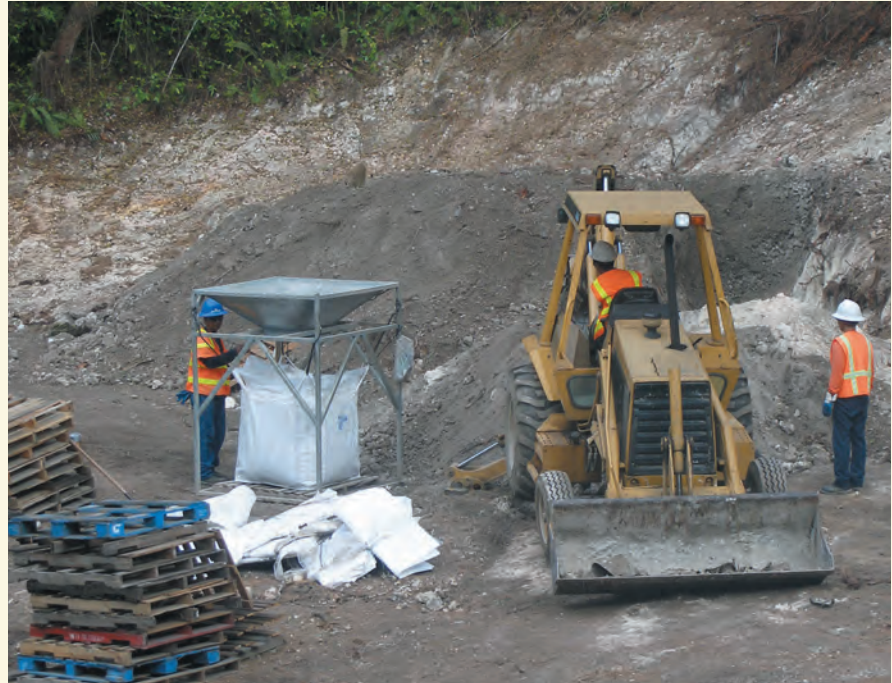
Contaminated soil is removed from the Edoni Formerly Used Defense Site According to Honolulu District FUDS Project Man- (FUDS) on Saipan. The extraction site was used by the U.S. military during ager Helene Takemoto, "our goal in the FUDS program and after World War II as a waste repository.

is to reduce risk to human health and the environment