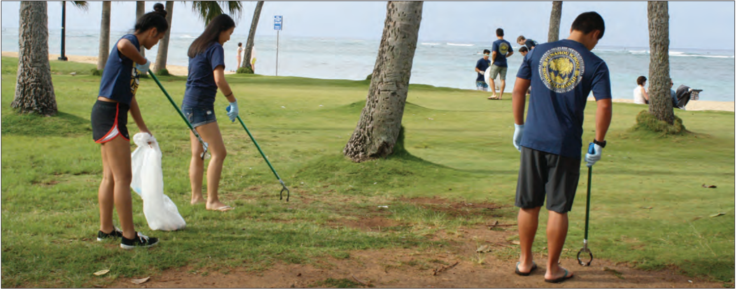
More than 20 volunteers from the Punahou Junior ROTC program along with Corps employees and their friends and families cleared trash and debris, as well as other obstructions on the beach and beach berm behind the U.S. Army Corps of Engineers Pacific Regional Visitor Center (RVC) in Waikiki as part of Earth Month 2017.