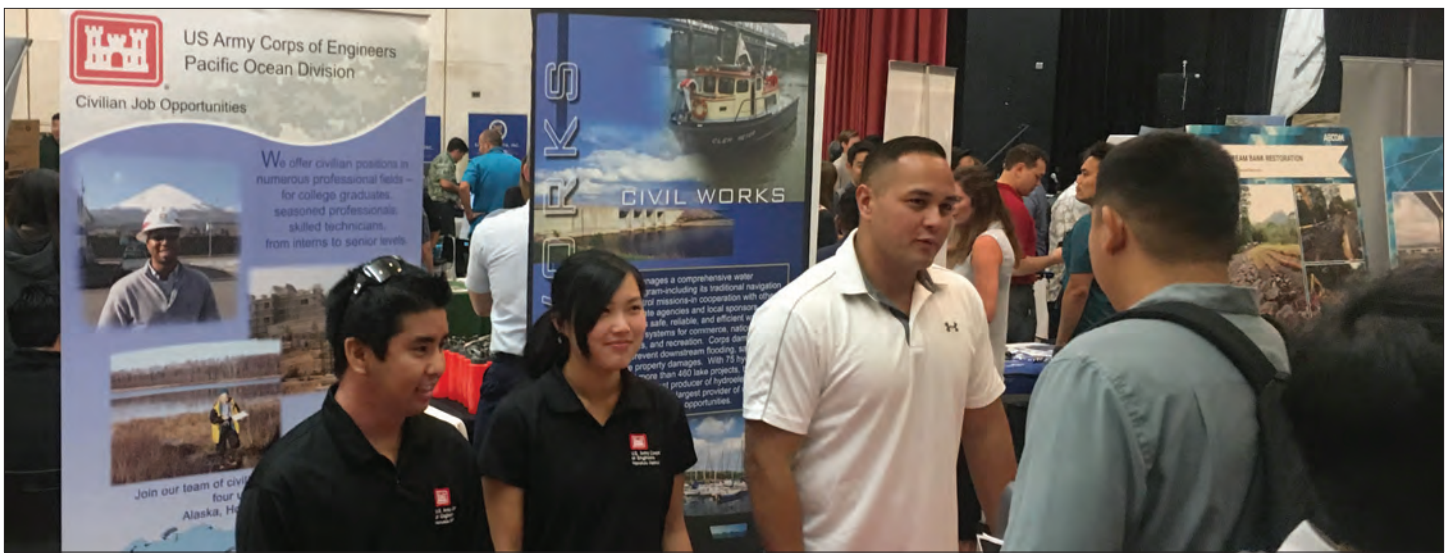
As part of National Engineers Week activities in Hawaii, our U.S. Army PATHWAYS interns, Workforce Management staff and engineers were on hand at the University of Hawaii at Manoa College of Engineering Career Fair, where they provided future engineers with educational career guidance, information on potential job opportunities within the Corps, as well as discussing potential STEM field career paths.