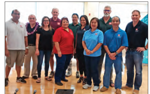
Honolulu District engineers and staff attended the Oahu 2017 MATHCOUNTS competition with 12 personnel volunteering their services as moderators, proctors and scorers for the competition.

The MATHCOUNTS program, in its 34th year, is sponsored by the National Society of Professional Engineers at the state and local levels to emphasize the importance of mathematical skills in the development of future technology and encourage students to excel in these areas. The U.S. Army Corps of Engineers recognizes the critical role that Science, Technology, Engineering and Mathematics (STEM) education plays in enabling the U.S. to remain the economic and technological leaders of the global marketplace, and enabling the Department of Defense and Army in the security of our Nation. The Corps is committed to teaming with others to strengthen STEM-related programs that inspire current and future generations of young people to pursue careers in STEM fields.