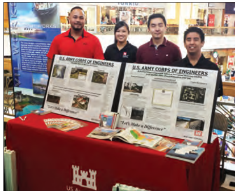
Our Department of the Army PATHWAYS interns created Corps of Engineers and Honolulu District photographic exhibits that showcased the District's missions for public display at Windward Mall in Kaneohe.