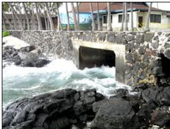
Keōpū Stream

U.S. Army Corps of Engineers, Honolulu District